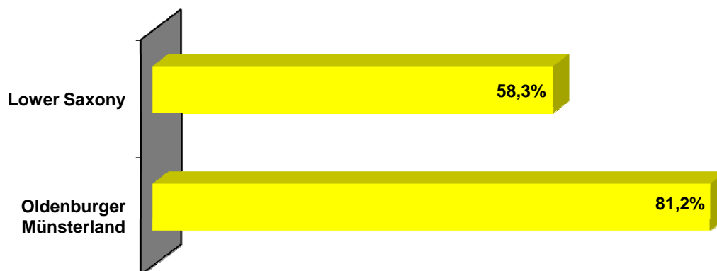
Share of own homes 2009 2)